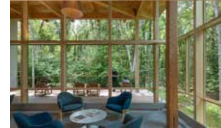
Superior execution of ‘surprise and delight’