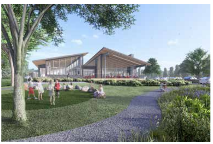
Draft design concept of the rear exterior, 75 Fennell Street (April 2024)

We are grateful for our committee volunteers and the