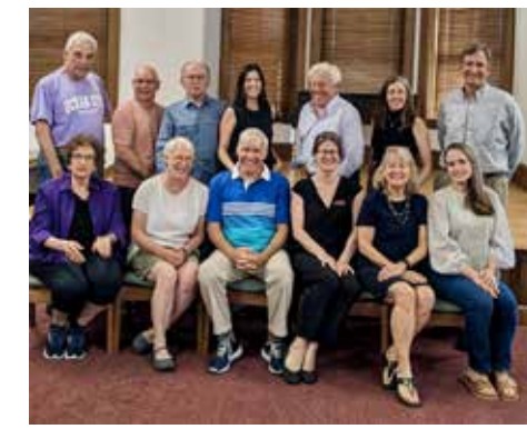
The Skaneateles Library Building Committee, a dedicated team (with a few members missing)

We are grateful to the following community members for being so generous with their expertise, commitment, and time as members of the building committee: