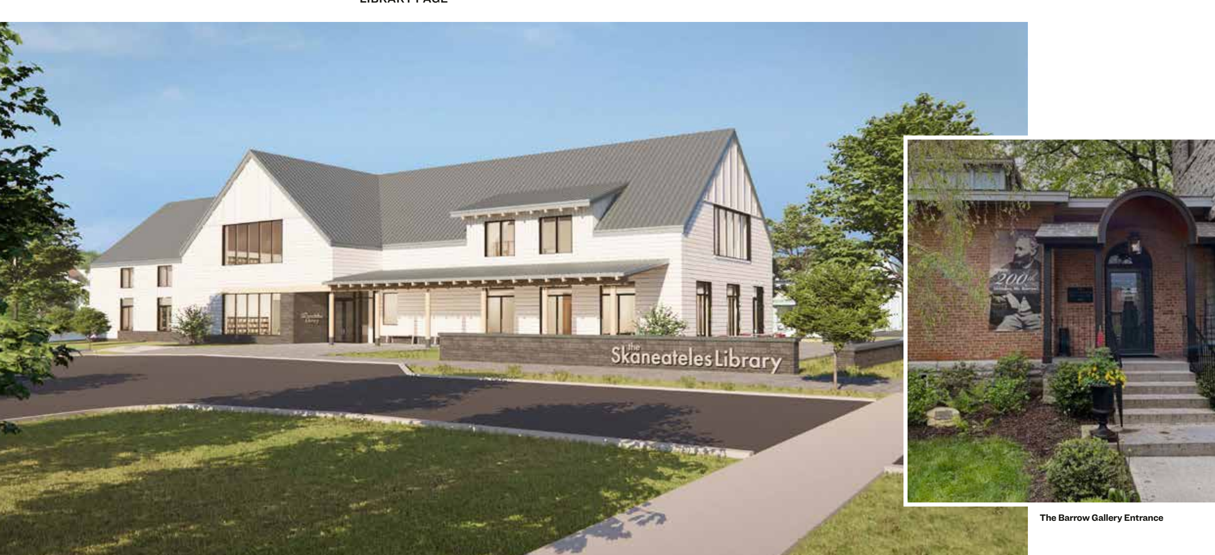
Draft Rendering New Building Entrance May 2025 Oudens Ello Architecture