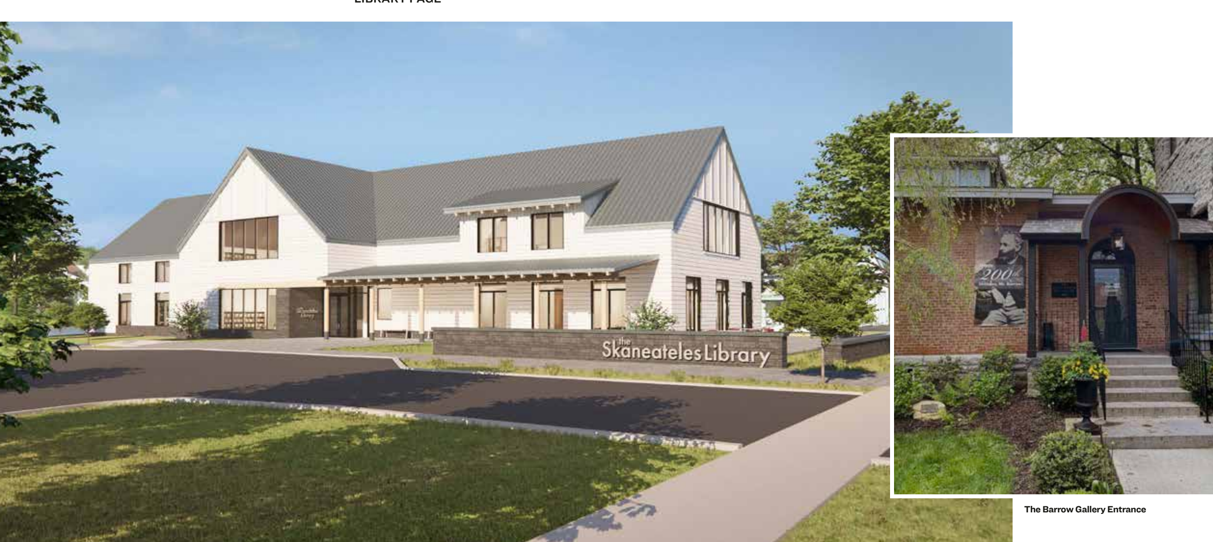
Draft Rendering New Building Entrance May 2025 Oudens Ello Architecture